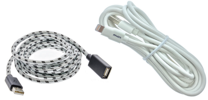
Aircraft-grade 2m USB extension cable